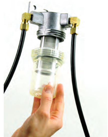
Kits 10-438 and 10-443 include pre-strainer body, bowl and screen, plus 5 Micron filter and mounting hardware.