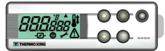
DIRECT SMART REEFER CONTROLLER